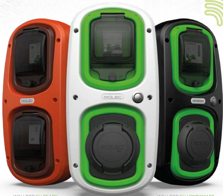
WALLPOD:EV READY 13A Socket Mode 2 Charging Unit

The WALLPOD:EV range provides Mode 3 fast charging in both 3.6kW and 7.2kW, as well as superfast 11kW and 22kW, speeds.