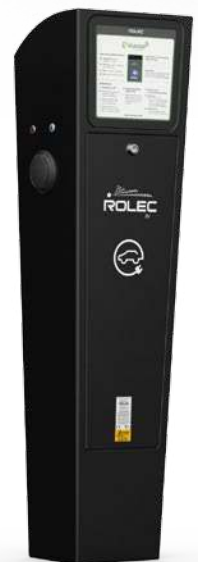
AUTOCHARGE:EV GROUP MANAGER - RFID Charging Pedestal