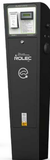
AUTOCHARGE:EV TOKEN MECH - PAYG Charging Pedestal