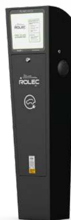
AUTOCHARGE:EV FREE TO USE Charging Pedestal

AUTOCHARGE:EV is designed to be compatible with all current PHEVs and EVs, providing Mode 3 fast charging in both 3.6kW and 7.2kW, as well as superfast 11kW and 22kW, speeds.