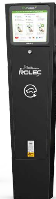
AUTOCHARGE:EV EV CHARGE.ONLINE Charging Pedestal